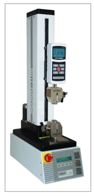
Shown with an ESM301 test stand and G1061 wedge grips

The Series 5's averaging mode addresses the need to record the average force over time, useful in applications such as peel testing, while external trigger mode makes switch activation testing simple and accurate. An ergonomic, reversible aluminum design allows for hand held use or test stand mounting for more sophisticated testing requirements. Series 5 force gauges are directly compatible with Mark-10 test stands, grips, and software.