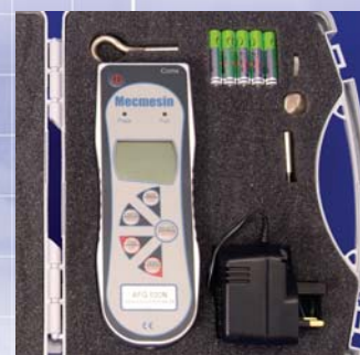
AFG and accessories