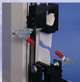
Textile tension test