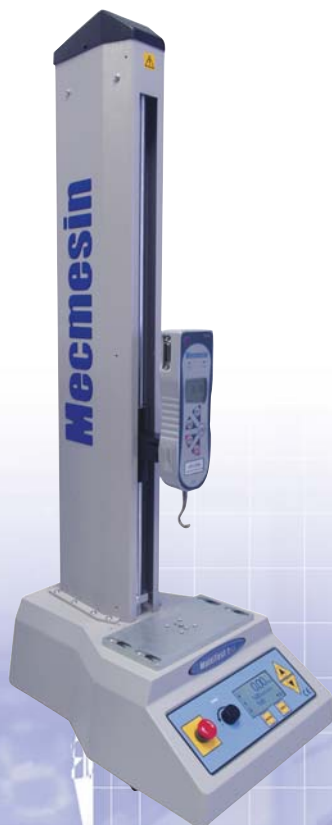
AFG shown mounted to the MultiTest-d motorised test stand

RS232, Mitutoyo, Analogue data output for easy data transmission