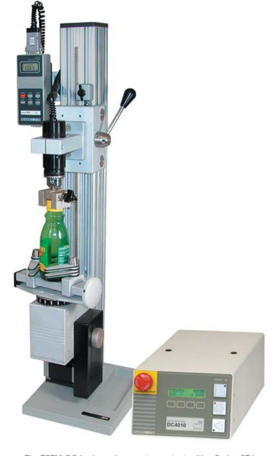
The TSTM-DC is shown in a cap torque test, with a Series STJ torque sensor, BGI force/torque indicator, and G1023 universal closure grip, and G1053 cap grip